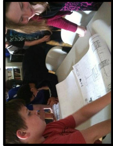
Checking on Plans with ALSC Architects.