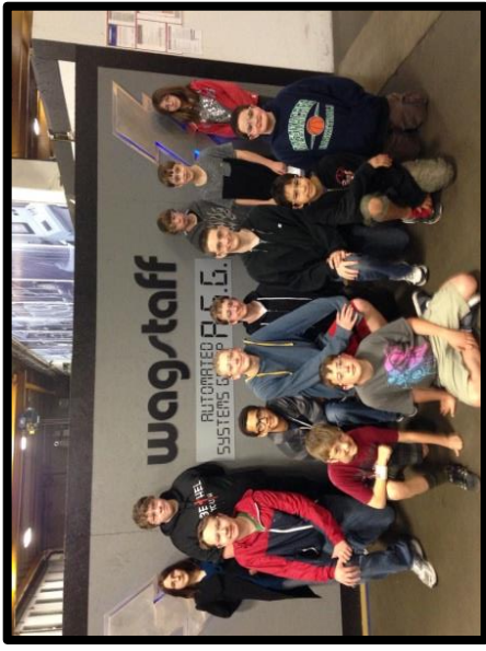
Tour at Wagstaff