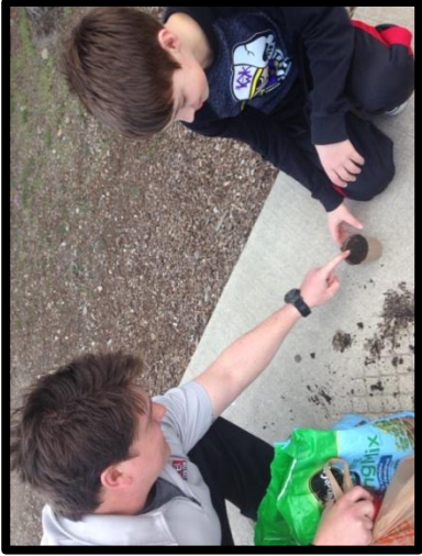
Program Director Helping with Gardening