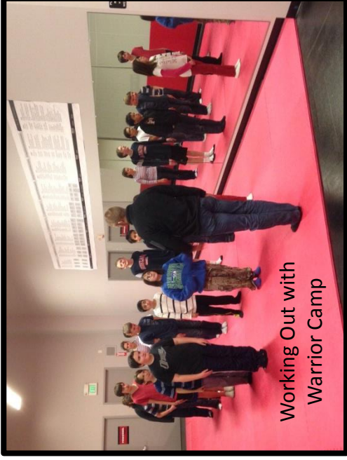
Working Out with Warrior Camp