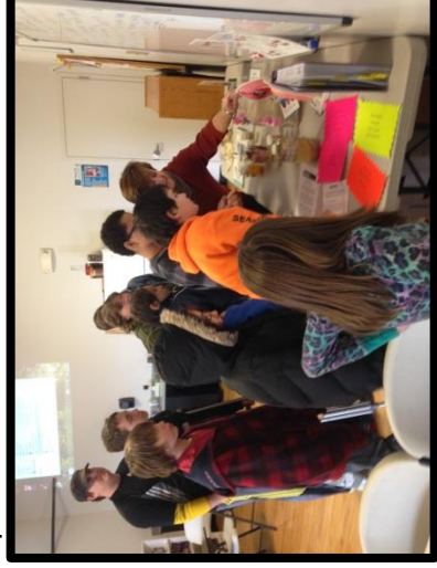
Hands on Activities with PetVet