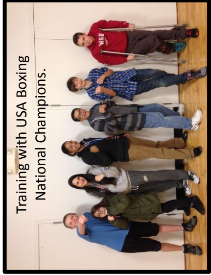
Training with USA Boxing National Champions.